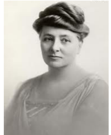
Maud Wood Park

Maud Wood Park served as president from 1920–1924. She was responsible for building the organization and guiding its development as a means to educate women to become knowledgeable voters. She also formed the Women's Joint Congressional Committee, an alliance of women's organizations, to lobby for issues such as the Sheppard-Towner Maternity and Infancy Protection Act of 1921 and the Cable Act of 1922. The Sheppard-Towner Act provided federal matching funds for programs designed to reduce maternal and infant mortality. The Cable Act ensured independent citizenship for married women. Prior to the act, the citizenship of a married woman immigrating to the United States was dependent on her husband's citizenship.