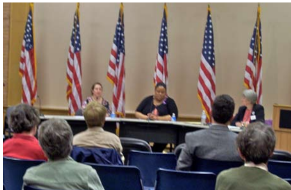
May League Day on Domestic Violence