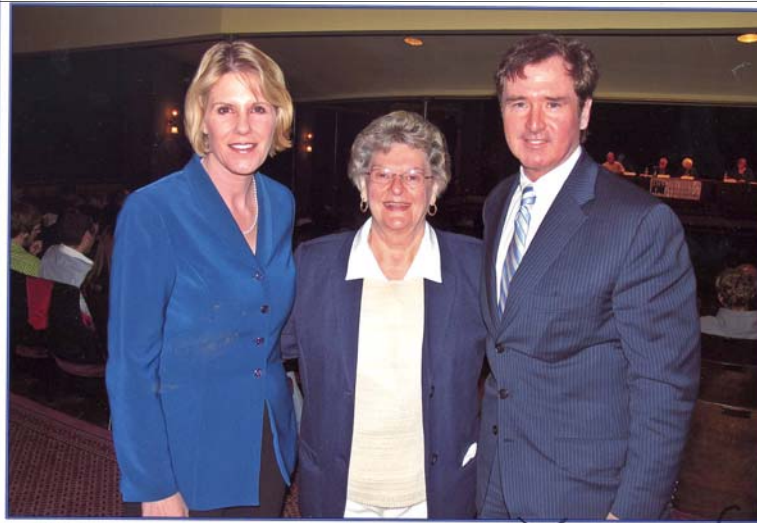
NY State Senator Catharine M. Young