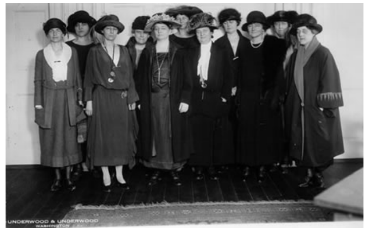
Pre-1923 National Officers