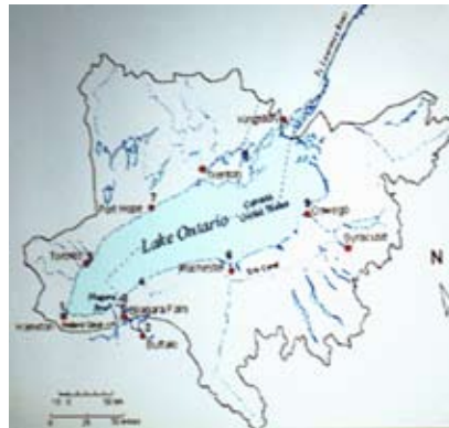
Map of Lake Ontario Watershed