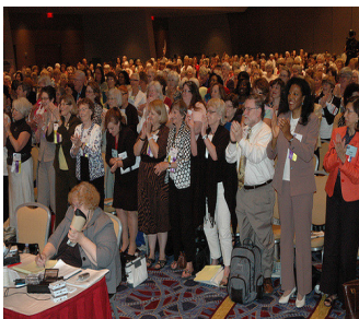
Concurrences and resolutions prompt standing ovation