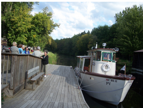
Waiting to board

Thanks to the many volunteers who have made this park a gem in our community. Visit it if you haven't already done so.