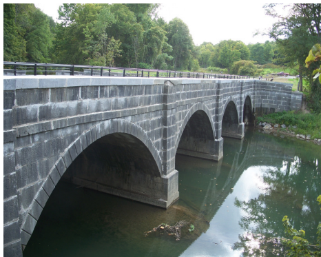
Aqueduct taking the Erie Canal over Nine Mile Creek