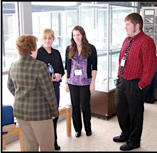
Student delegates informally chatting with Assembly-woman Duprey

continued from p. 4 "Meet the Legislators"